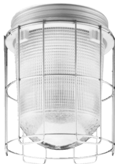
With optional P241 wire guard.