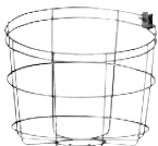
P23 – use with refractors