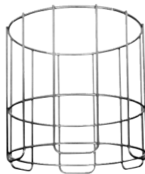
P33 – use with G303 globe