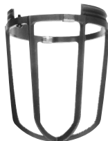
P21 – use with G24 globe