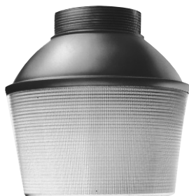
R2, R5, PR2, PR3, PR5