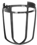
P50 – use with G54 globe