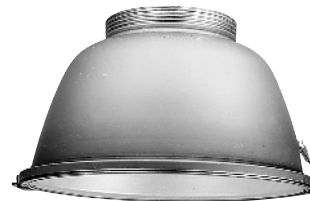
Reflector/Lens – Etched Alzak aluminum reflector/tempered glass lens