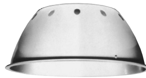
Dome – Krydon® material