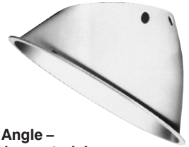
30° Angle – Krydon material